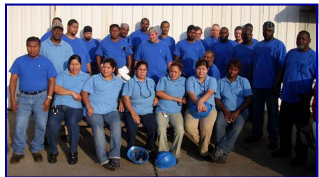
Above, our team at Roxboro in new uniforms, donning the "new look" for BNI at Progress Energy Fossil Plants.