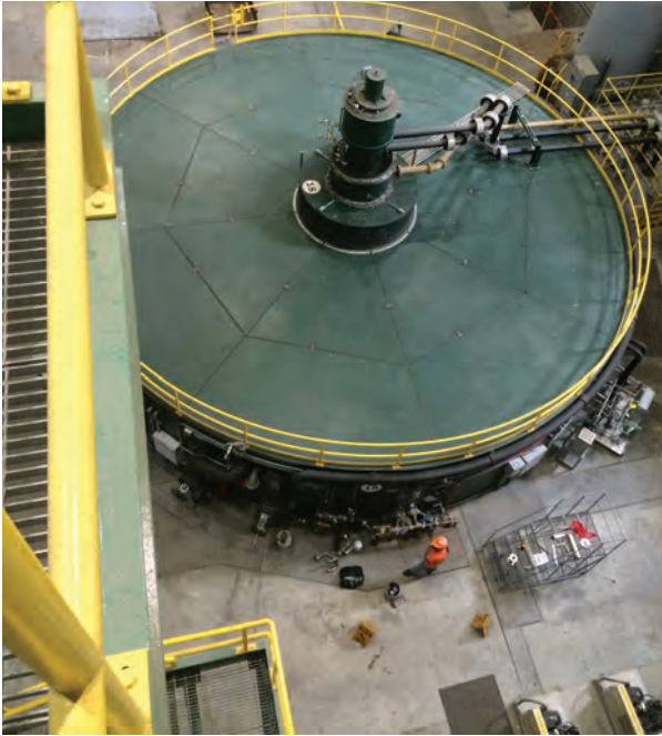
KAPLAN BLADE LOWERING AND INSTALLATION