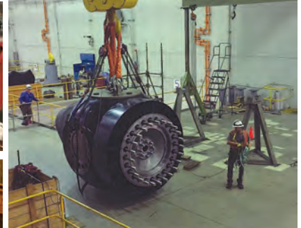
RUNNER HUB LIFTING AND INSTALLATION