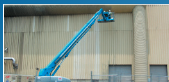
Facility Maintenance Services