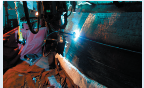
Coke Drum Repairs

BHI has extensive expertise in every type of weld repair performed on Coke Drums to include: bulge reinforcement, skirt repairs and replacement, cone repairs and replacement, elephant skin, throughwall cracking, internal cladding repair, temperbead repairs, and others.