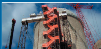
Civil Maintenance & Scaffold Services