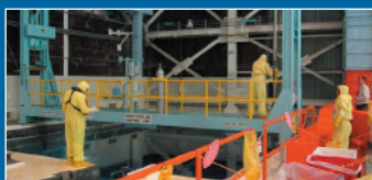
Radiation Protection, Radiological Engineering & Related Services