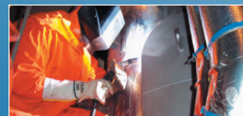
Specialty Welding & Machining