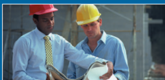
Maintenance & Modification Services

We bid, plan and deliver projects better than anyone else, meeting or exceeding all safety standards. We're able to reduce planned schedule durations and deliver the highest quality services in either emergent or well-planned scenarios. We tie our success to yours, with performance-based guarantees and an unsurpassed track record across the industry.