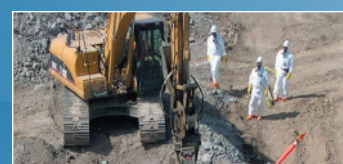
Decontamination & Decommissioning