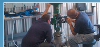
Instrumentation, Controls & Electrical Services