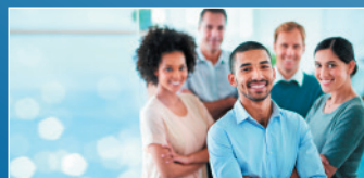
Professional Technical Staff Augmentation