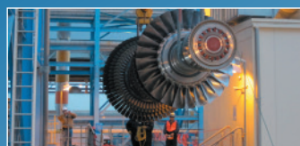
Turbine & Rotating Equipment Services